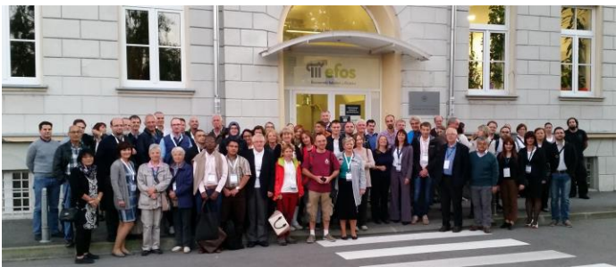
Participants of KOI 2016

119 papers presented, 237 authors and co-authors, 147 registered participants who presented their papers, 79 participants from abroad (53.74%), 68 participants from Croatia (46.26%), 5 invited lecturers.