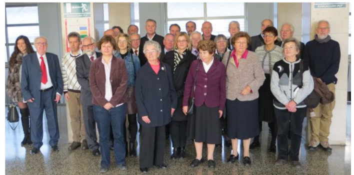
Participants of 50 th anniversary celebration