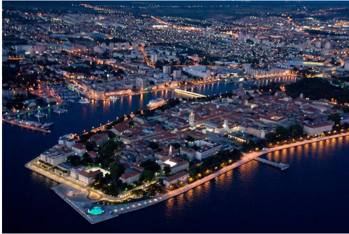
Zadar at night