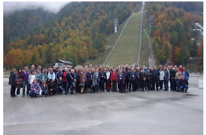
SOR '17 participants, [ http://sor17.fov.uni-mb.si/sor17-highlights/ ]

All accepted papers are published in the SOR '17 Proceedings available at: http://fgg-web.fgg.uni-lj.si/~sdrobne/sor/SOR'17%20-%20Proceedings.pdf .