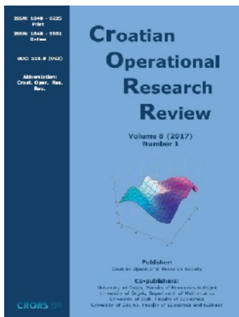
Figure 1: Croatian Operational Research Review .